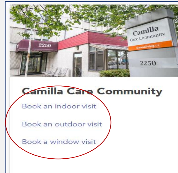
Step 2 – Select Type of Visit