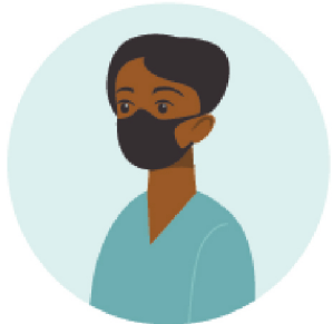
3 Layer Cloth Masks