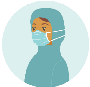
Surgical/ Procedure Type Masks (tie or ear loop)