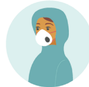
Masks with vents*