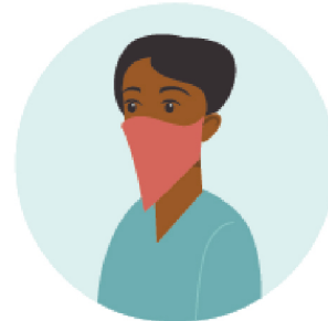
Bandana/ Neck Gaiter