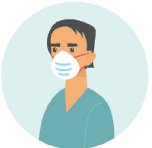
N95*/KN95 Masks without Vents