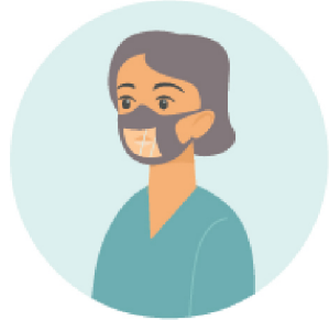
Mask with Plastic window